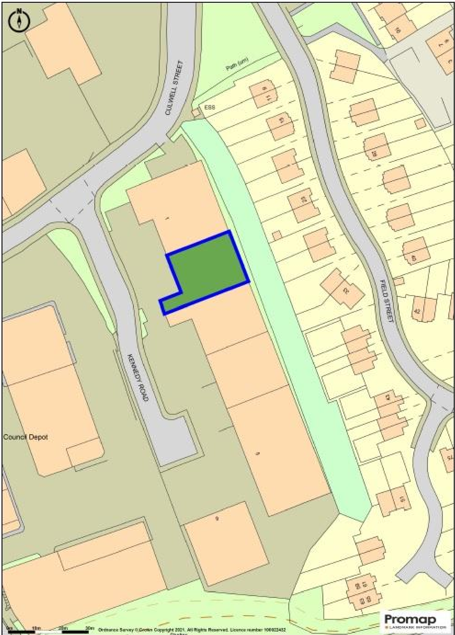
Site Plan- For identification only- Not to scale. Accuracy cannot be guaranteed