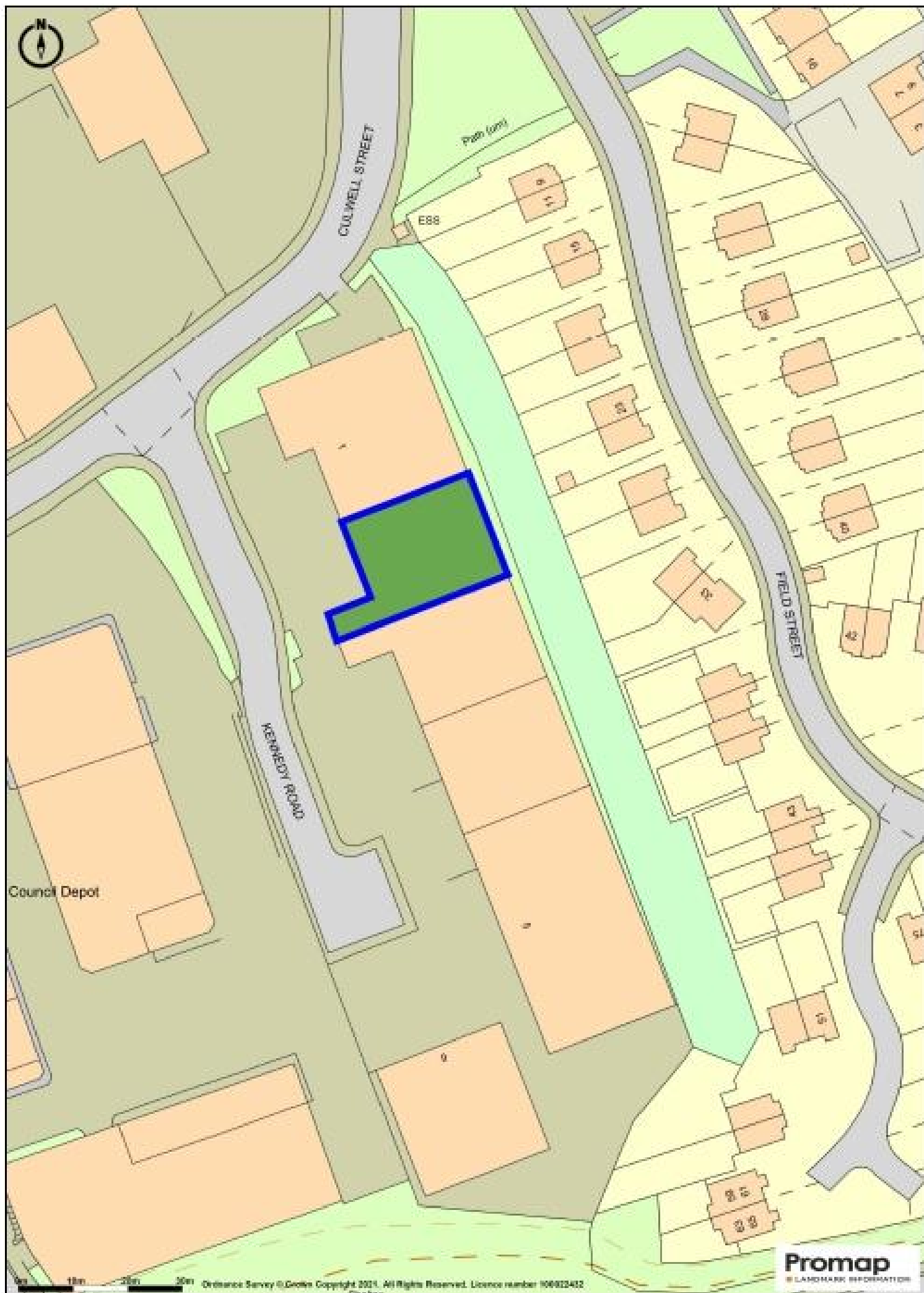
Site Plan- For identification only- Not to scale. Accuracy cannot be guaranteed